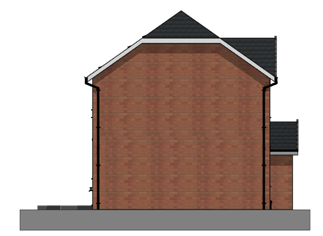
Left Side Elevation. 1:150