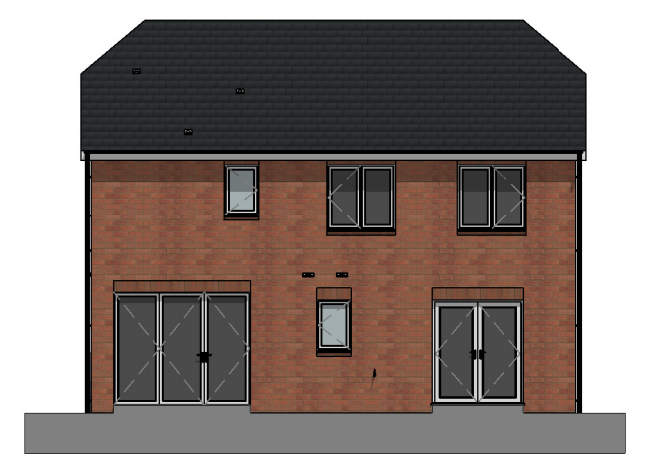
Rear Elevation. 1:150