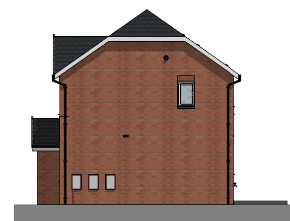
Right Side Elevation.